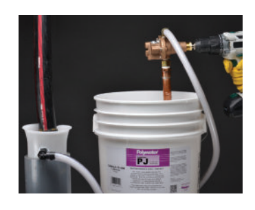
Polywater PJ Lubricant can be used with the Polywater® LP-D5 drill-powered pump.

W in the catalog number indicates Winter Grade version.