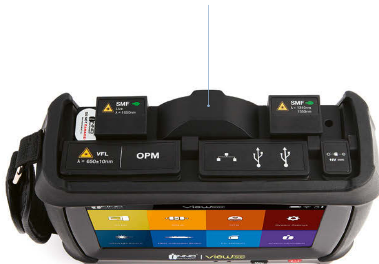
Singlemode OTDR live Port